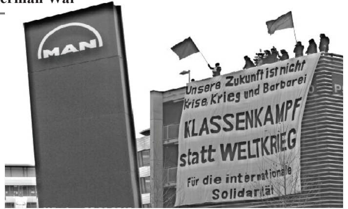
On the roof of the war concern MAN in Munich, January 2012. The banner read: „crisis, war and barbarism are not our future - class struggle instead of world war - long live international solidarity“

To prepare for a war, one needs people who can drive tanks and control drones and launch equipment. If one wants a war, one needs to ensure that coming generations consider warfare as a “normal” circumstance. For this reason the German military is looking to enter schools, universities and vocational training. The military trains and educates teachers. Occasionally, it just runs classes itself. The military promotes its training material and tries to lure with class trips. On average, the military performs 19 events every day at schools, universities and youth clubs. The expenses to attract new personnel have increased from 9.2 million euros in 1998 to 29 million euros in 2012. The main motivation is the salary: no other job in Germany is as well paid as that of a soldier in Germany. This militarization secures the military personnel for future wars and also gets people used to a state of war. The ruling class puts massive amounts of money into this and educational institutions enter on cooperation agreements with the military on a massive scale.