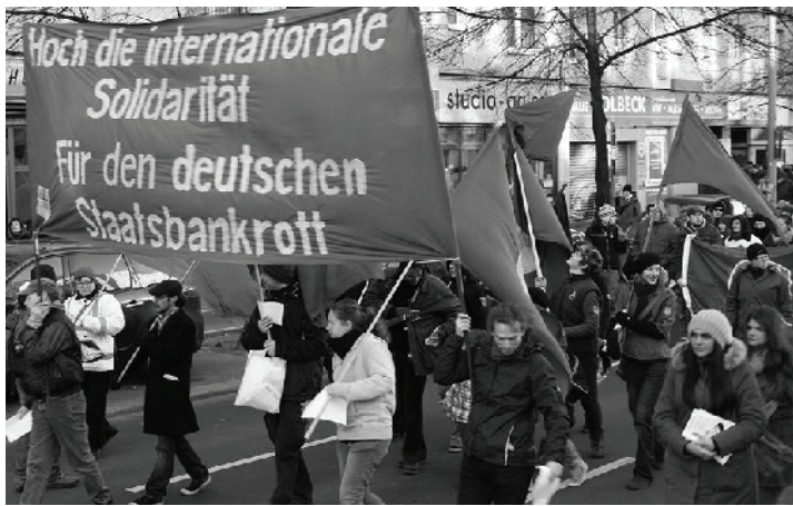
At the annual Luxemburg-Liebknacht March in Berlin, 2012. Our statement on the banner: „Long live international solidarity - Pro German national bankruptcy“

The world is divided: on one side exploitation and oppression in all countries with hunger, illness and poverty – on the other side a world of wealth which could have ended this misery long ago. We're separated from this wealth by the rule of a system that is no longer capable of meeting the necessities of mankind. The worldwide crisis and the decay of production prove it every day: the old order has become an obstruction to the progress of mankind. The system of capitalistic exploitation does no longer work, it is no longer possible to expand production. Never before has there been more capacity for work and never before has it been wasted as much. We witness a futile battle for survival of the old order.