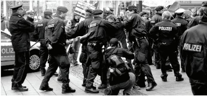
On a lot of manifestations, police attacked everyone wearing the FDJ symbol, which led to arrests and criminal lawsuits.

We also know: through the ruins of today's world we can see the world of tomorrow. There is nothing that will save the few monopolies which rule the wealth of the world today and command billions.