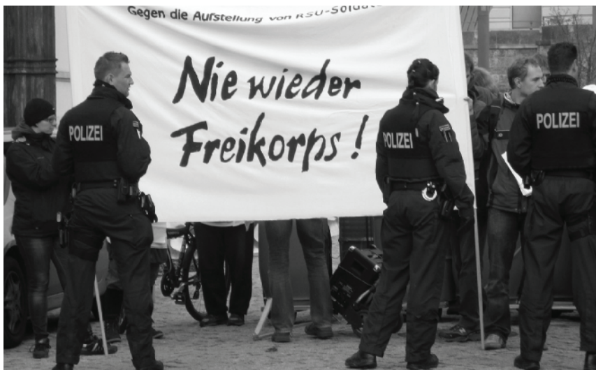
Rally against the installation of the RSUKs in Dresden, 2013 reservist squads, called RSUKs (regional safeguarding and supporting forces) These resemble the “Freikorps” (volunteer corps) in the German 1920s

“safeguarding and supporting forces” are being established. These are similar to the “Freikorps”, militants who were fighting down the November-revolution of 1918 after WW I. They acted against workers, killed Karl Liebknecht and Rosa Luxemburg and were early supporters of fascist terror. The current incarnation of the “Freikorps” are trained by the military. Members are reservists who have agreed in writing to be deployed in Germany. Many of them are stationed near big factories like Daimler, Audi and BMW.