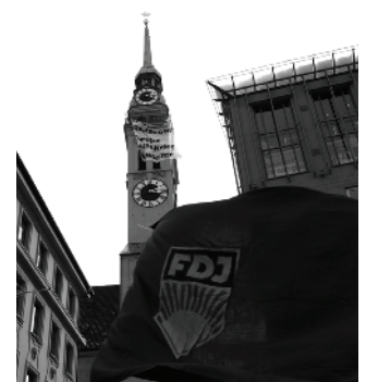
Manifestation against the NATO Security Conference in Munich, 2012. Common bloc with other youth organisations. The banner read: „German diktat over Europe means war - Never again“

Repeating this message at St. Peters Church in Munich.