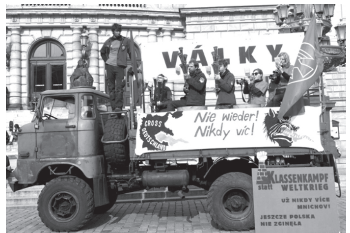
Participation in the Anti-War-Campaign Class Struggle Instead of World War.

German imperialism is an excellent robber. It would not need robbery, if the American car industry would